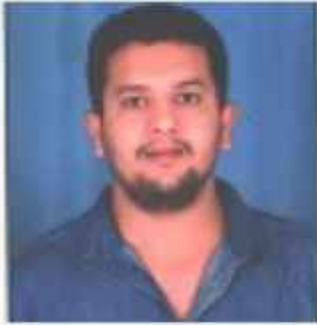
VARUN A Company : 3SC solutions Package : 4 LPA